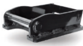
Quick hitch adapter